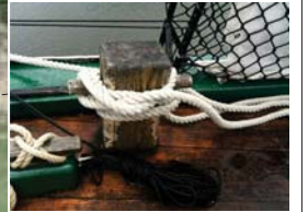
EXAMPLE OF NAUTICAL TIE DOWN AND ROPE BORDER