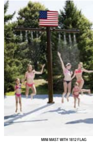
MINI MAST WITH 1812 FLAG