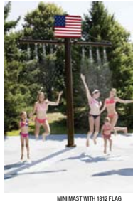
MINI MAST WITH 1812 FLAG