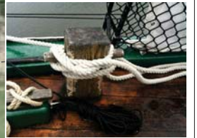
EXAMPLE OF NAUTICAL TIE DOWN AND ROPE BORDER