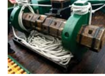
EXAMPLE OF CUSTOM STERN TO REPLICATE EXISTING