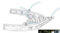
EXAMPLE OF CUSTOM BOW TO REPLICATE EXISTING