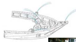
EXAMPLE OF CUSTOM BOW TO REPLICATE EXISTING